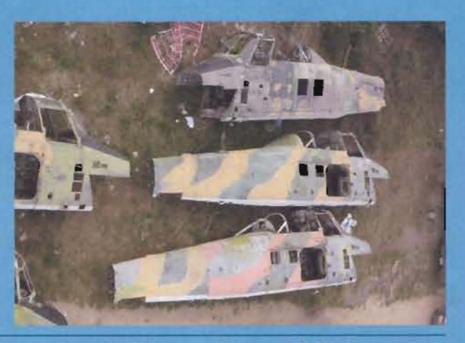
"For decades to come aquatic plants, corals and untold numbers of fish and divers will appreciate the new 'Coral Reef Squadron'."